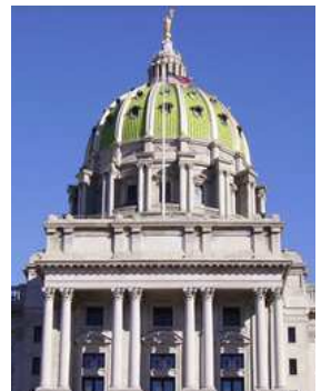
Harrisburg Capitol Dome